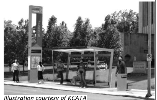
Illustration courtesy of KCATA

Kansas City's first MAX line, which started in July 2005, serves Main Street between downtown and the Plaza, with some extended service continuing south to 74th & Wornall. Current stations are identified by steel and glass shelters and tall markers which display the arrival time of the next MAX bus.